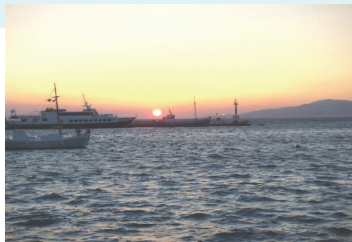
Sunset on the Island Mykonos

Hosted by the Chapter #98 New Haven AHEPA