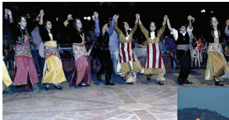
Group dancing in Pontian Greek uniforms, at a reception in Giannitsa.