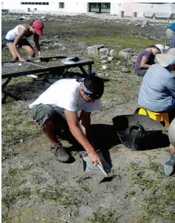
CCSU group during the Archeological excavations in Pella and their host city of Giannitsa.