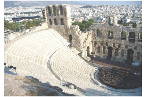
The theater of Herodes Atticus Acropolis in Athens