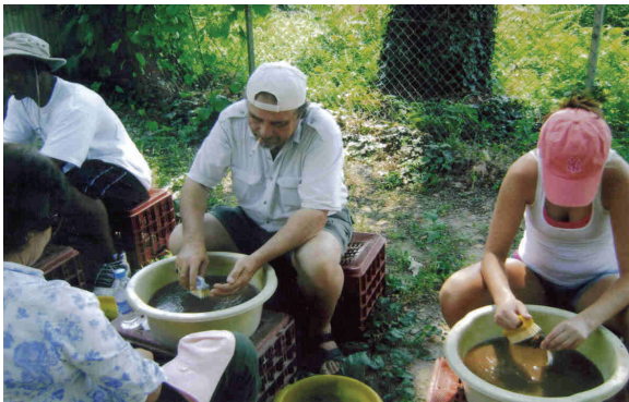
Giannitsa (sister city of New Britain)