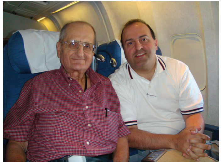
On the plane; returning home from Greece