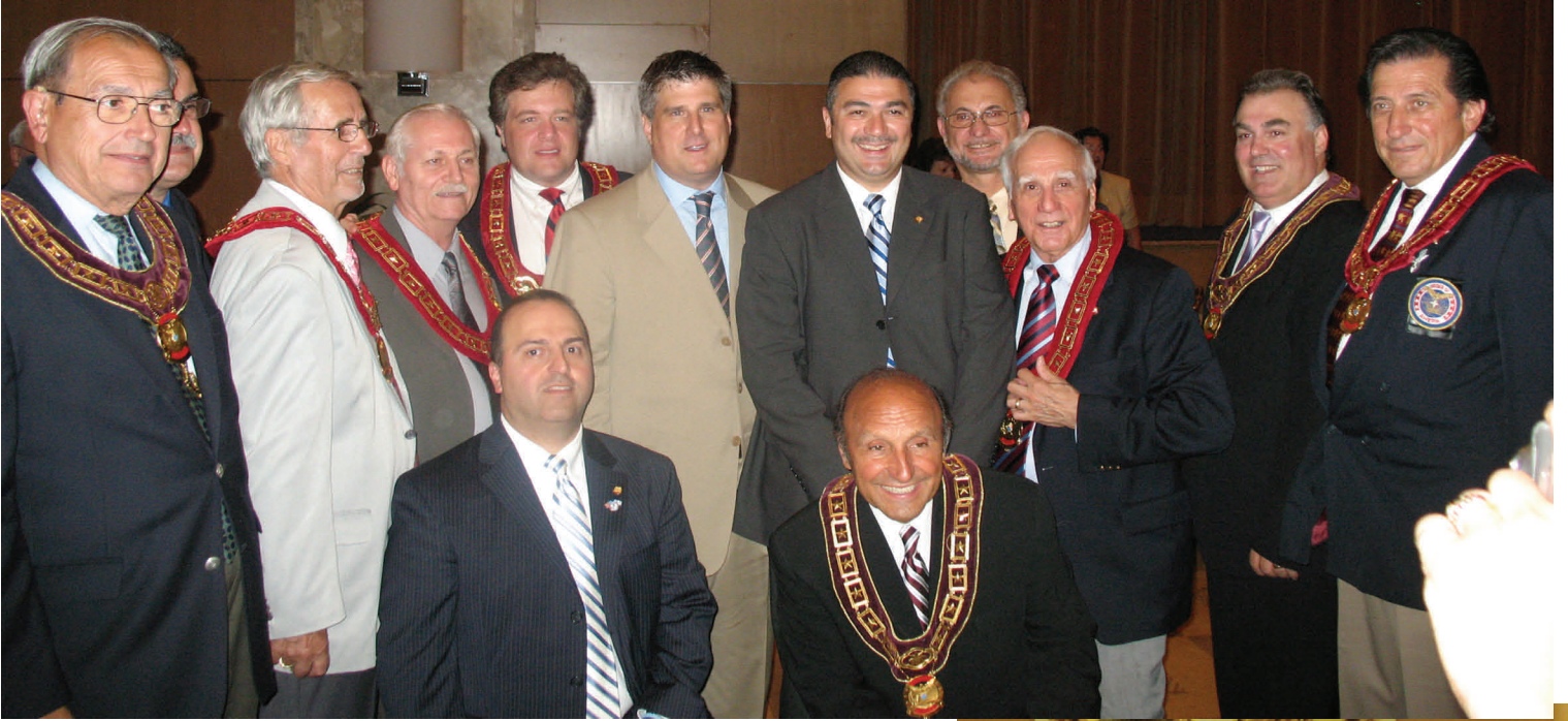
Supreme Lodge 2008-2009